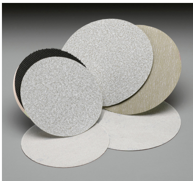
50 Discs per box / 4 boxes per case.

Hook & Loop discs actually keep the cutting surface cooler because air can circulate between the disc and the pad. A cooler cut is a plus on thinner metals because it minimizes the chance of warping.