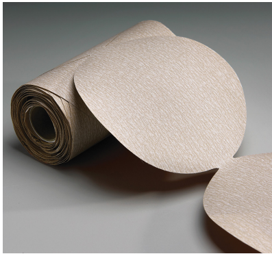
100 Discs per roll / 4 rolls per case.

Pressure Sensitive Adhesive (PSA) discs on a roll offer the convenience of keeping the discs all together and handy for use on any job in the shop.