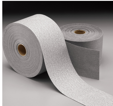
1 Roll per pack / 5 rolls per case.

Pressure Sensitive Adhesive (PSA) rolls can be torn to any length to fit a block or file board so you have completely flexibility no matter what size the repair.